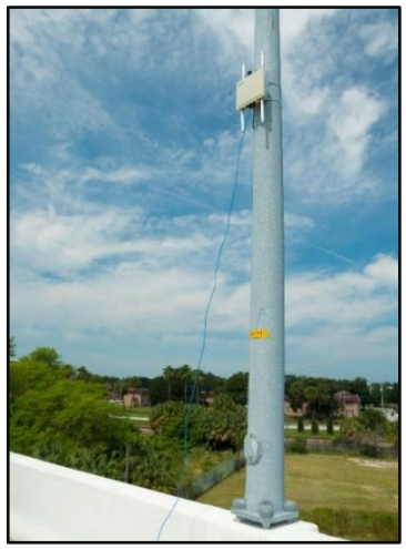
Highway pole mounted DSRC