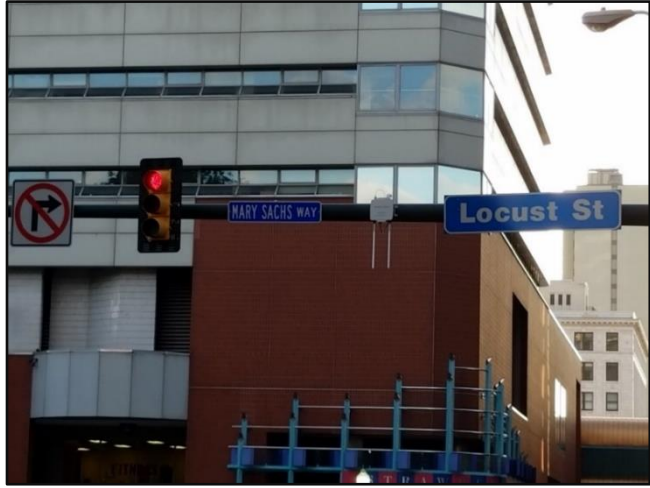
DSRC radio installed on traffic signal mast arm

The following images are a few examples of optimal positioning of DSRC radios, where they have a clear line of sight without physical or vegetation obstructions between proposed RSU location(s) and all roadway approaches necessary for the CV application. As shown in the images, the DSRC antennas should be installed facing down toward the ground while the GPS antenna face up toward the sky.