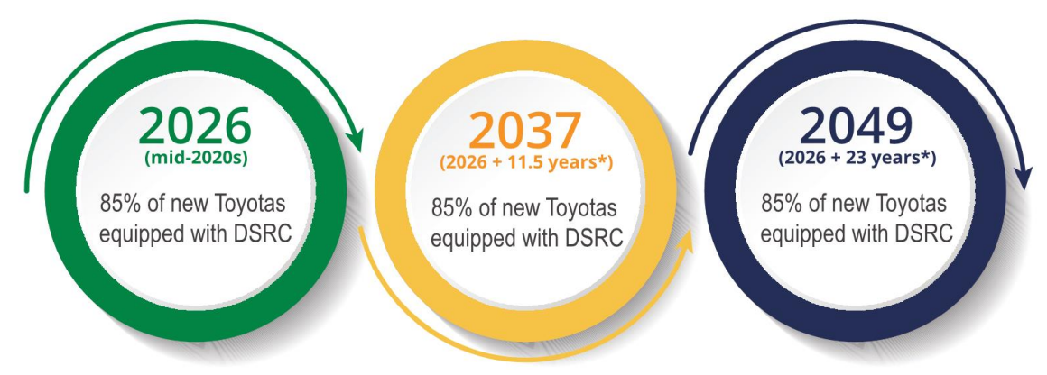
Figure 3 – Toyota DSRC Penetration Scenario

Over the past 13 years, Toyota has collaborated with other automakers, infrastructure organizations, and the USDOT to further develop DSRC technology and has stated that most of their models will have DSRC capabilities by "mid-2020s."<sup>2</sup> Based on this information, Figure 3 presents a potential DSRC penetration rate for Toyota's vehicles on the roadway in the United States.