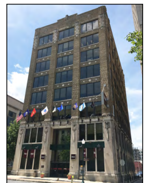
Dauphin County Veterans Memorial Building, Home of TCRPC

The preparation and distribution of the TCRPC Newsletter is financed in part by grants from the U.S. Department of Transportation, the Pennsylvania Department of Transportation, and Dauphin and Perry counties.