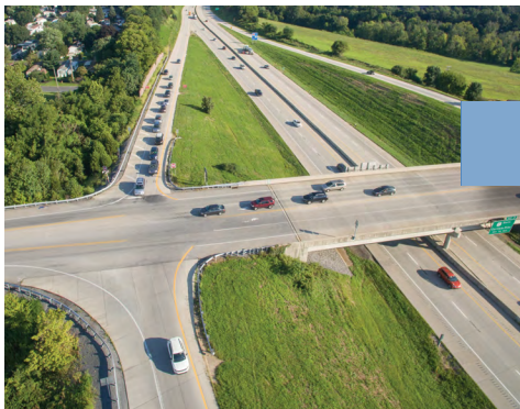
Creekview Road Interchange Cumberland County