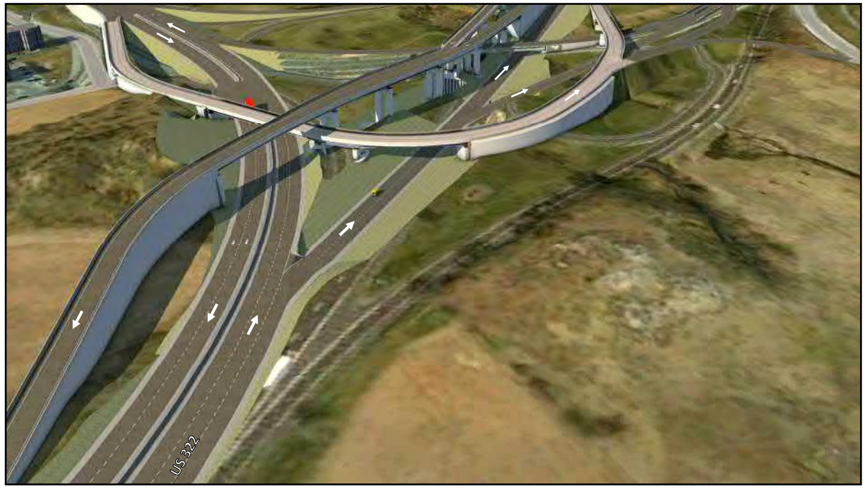
2. Northeast View