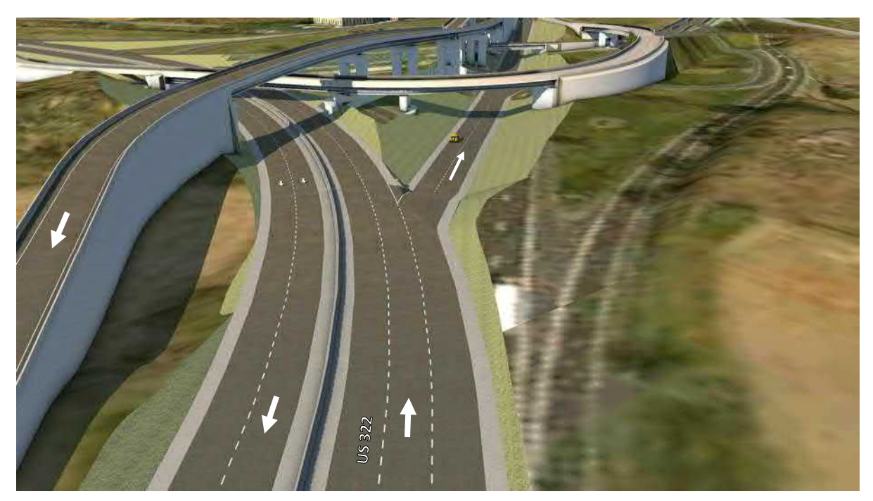
5. Route 422 and Route 322 Exit Ramp