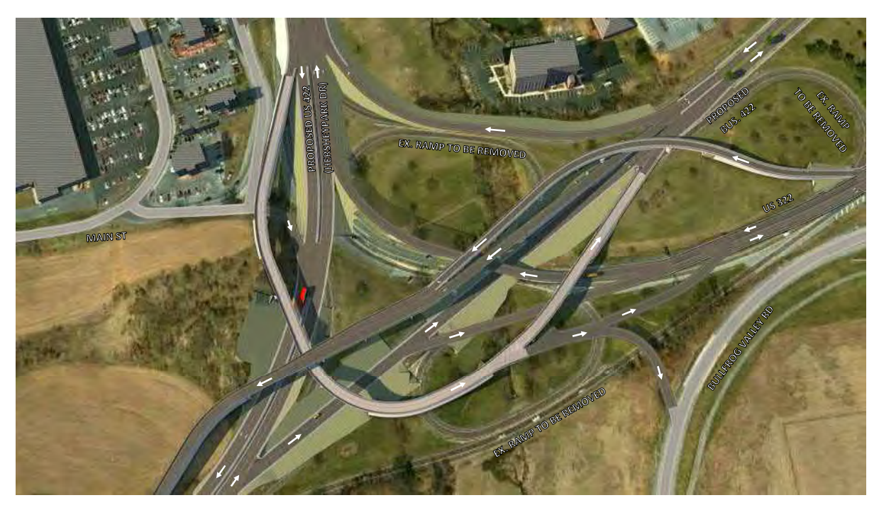
1. Top View