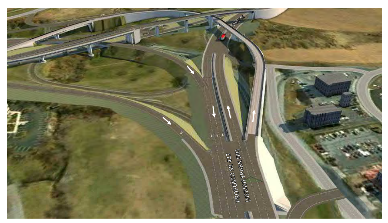
3. Facing Southwest