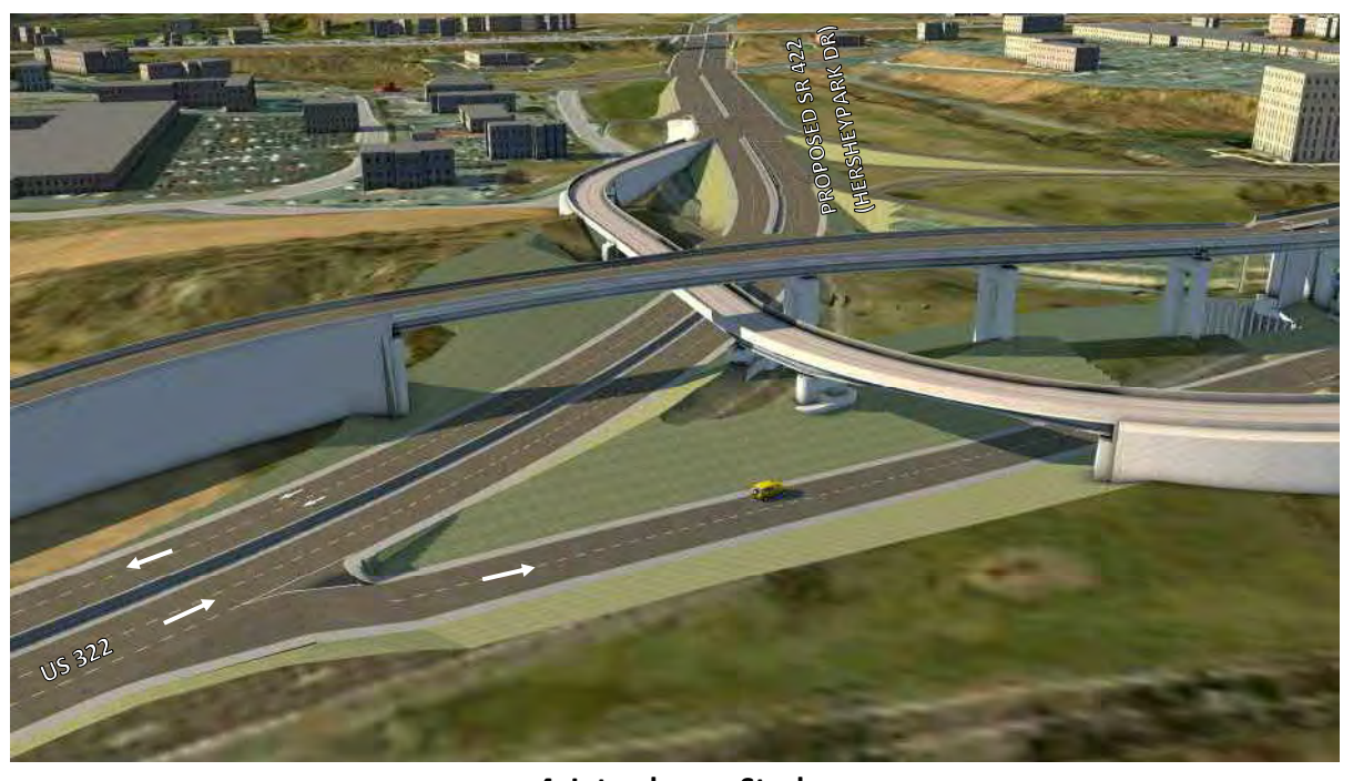
4. Interchange Stack