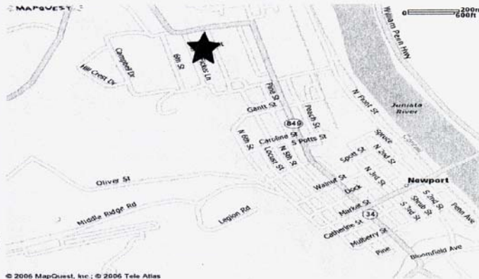
MAP FOR MEETING 3

Date: December 7, 2006 Time: 7:00 – 9:00 P.M. Place: Newport High School Cafeteria Address: Newport School District P.O. Box 9, Fickes Lane Newport, PA. 17074