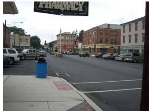
Newport Borough Historic District

The Bureau manages the National Register of Historic Places. Properties listed in the Register includes districts, sites, buildings, objects that are significant in American history, architecture, archaeology, engineering and culture. The Bureau works with individuals, communities, local government and state and federal agencies to educate Pennsylvanians about our heritage and its values to build better communities through preservation. The PHMC also conducts a landmark identification program, which presents plaques (Historic Markers) to property owners with statewide and national historic significant properties. Descriptions of the Historic Markers are shown in Table 2-3 . Table 2-4 identifies the two designated Historic Districts in the county. One is located in the Little Buffalo State Park and the other is located in Newport Borough and Oliver Township ( see Map 2-2 ).