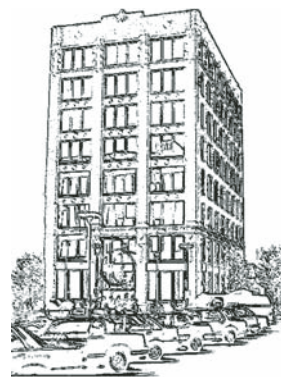
Dauphin County Veterans Memorial Building Home of the Tri-County Regional Planning Commission

The preparation and distribution of the TCRPC Newsletter is financed in part by planning grants from the U.S. Department of Transportation, the Pennsylvania Department of Transportation, and by grants from Cumberland, Dauphin, and Perry Counties.