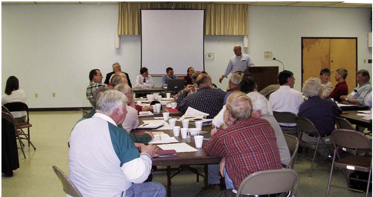
Ag Zoning Meeting in Cumberland County