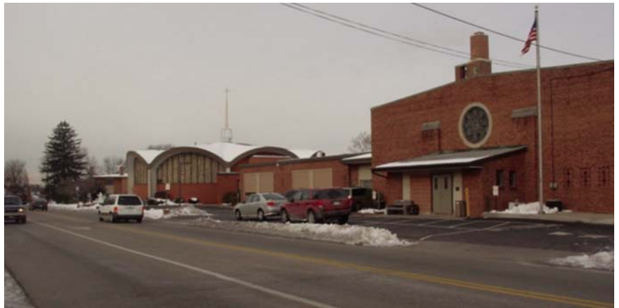
St. Catherine Laboure School

In addition to selecting which projects should receive HATS TE/HTS/SRTS funding, the HATS committees also forwarded two projects to the statewide Transportation Enhancements Advisory Committee to be considered for statewide TE/HTS/SRTS funds. Those two projects were the Walnut Street Bridge Western Span Restoration in the city of Harrisburg and the Steelton Borough Main Street Improvements, Phase II. PennDOT later selected a third project, the Appalachian Trail Conservancy PA 944 Crossing in Middlesex Township, Cumberland County, to also be considered for statewide TE/HTS/SRTS funds. All three projects are regional in nature and could provide a broad-based positive benefit to the community. The projects will need to compete with TE/HTS/SRTS projects that only qualified for statewide TE/HTS/SRTS funds and local projects submitted for statewide TE/HTS/SRTS funding consideration by other MPOs and RPOs throughout the state.