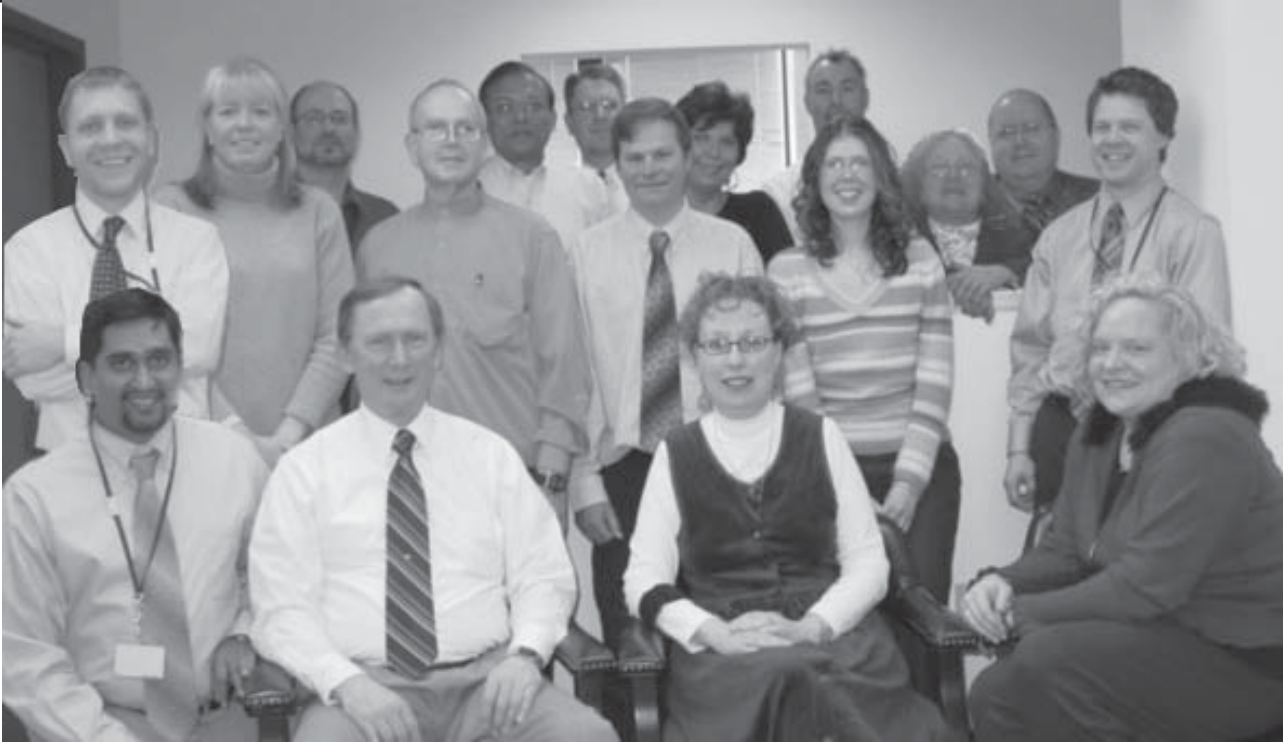
Tri-County Regional Planning Commission Staff